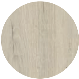
ROMANTIC OAK LIGHT H780 / W06