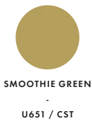
SMOOTHIE GREEN - U651 / CST