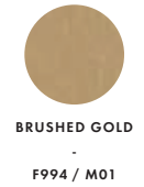
BRUSHED GOLD - F994 / M01