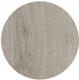
DESERT BRUSHED OAK GREY H787 / W05