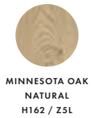
MINNESOTA OAK NATURAL H162 / Z5L