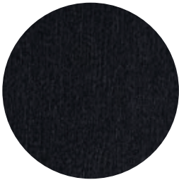
ELEGANT BLACK 113 / W06

“We always use a reference point for that, like a candle or a piece of fabric, and we look at how we can reproduce that colour as accurately as possible. After all, a colour can make or break a decor. You can also see that in the show piece from our new collection, a black veneer wood decor. We developed that with a specific technology that minimises how much light is reflected, so that the colour is guaranteed to be maintained. When it comes to our wood decors, we opt for perfect, natural colours ranging from light to dark, so the decors suit any style of interior design. Together with a matt texture, they really do look like genuine wood!”