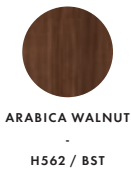
ARABICA WALNUT - H562 / BST