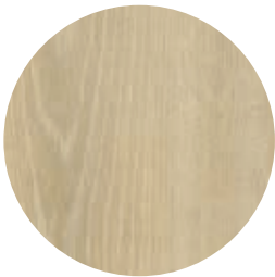
ROBINSON OAK LIGHT NATURAL H784 / W06