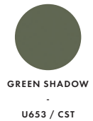
GREEN SHADOW - U653 / CST