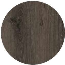
DESERT BRUSHED OAK BLACK BROWN H789 / W05