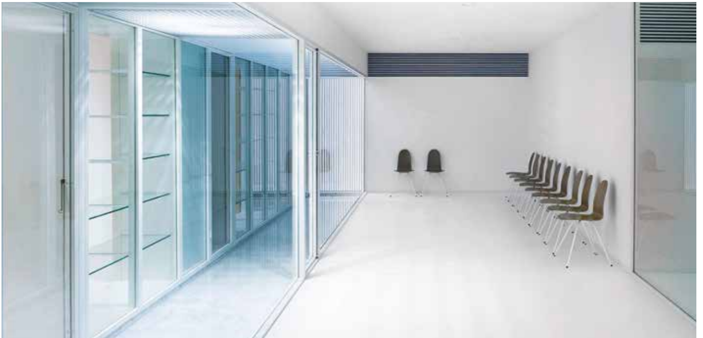
Tongue chairs MEDICAL CENTER ZARAGOZA Zaragoza, Spain