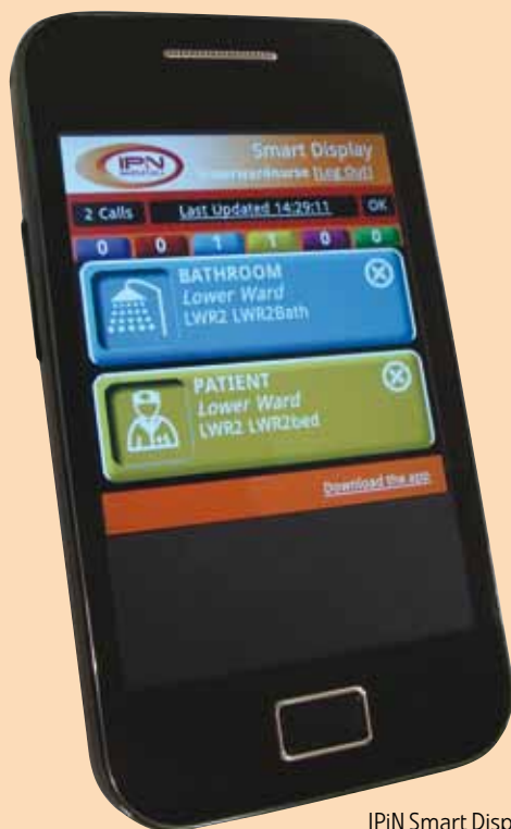
IPiN Smart Display

Comprised of IPiN SmartServer and IPiN Smart display modules, IPiN Mobile offers an integrated, easy to use and portable means for hospital staff to transfer and receive calls. IPiN Mobile displays the IPiN nurse call screen on Android mobile phones enabling quick and efficient reaction to calls, ensuring patient safety and wellbeing.