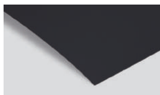
PerfectSense Matt Laminate