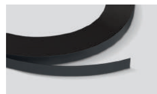
PerfectSense Matt Edging (ABS/PMMA)