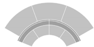
Ø2960mm versions with drop-in desks