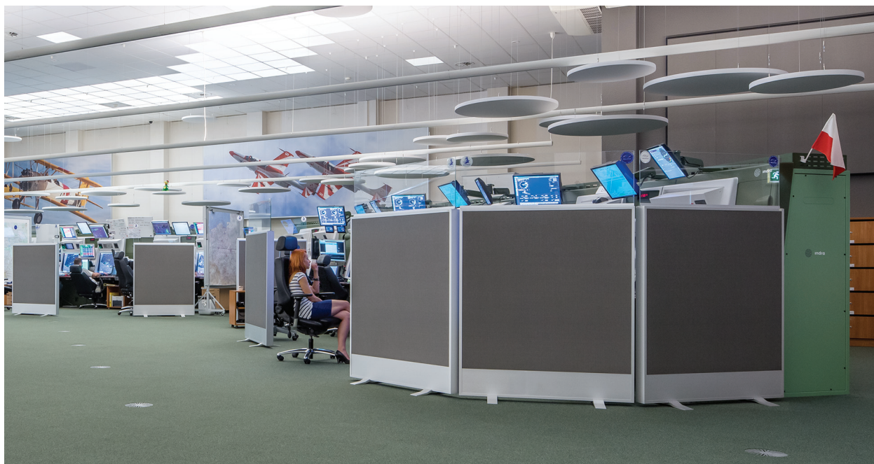
Polish Air Navigation Services Agency - Air Traffic Control Centre, Warsaw, Poland

of the screen, total height of screen 1820 mm. The feet are naturally anodised aluminum.