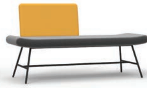
s482 - 02 RH