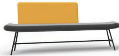
s483 - 02 RH