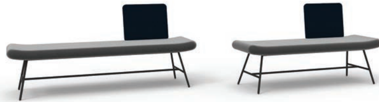
s483 - 01 LH