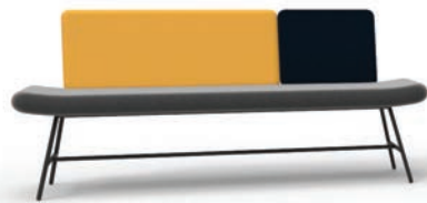
s483 - 03 RH