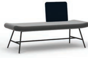
s482 - 01 LH