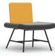
s481 - 01