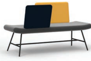
s482 - 04 LH