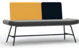
s482 - 03 RH