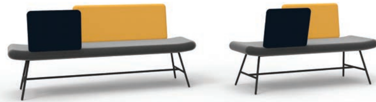
s483 - 04 LH