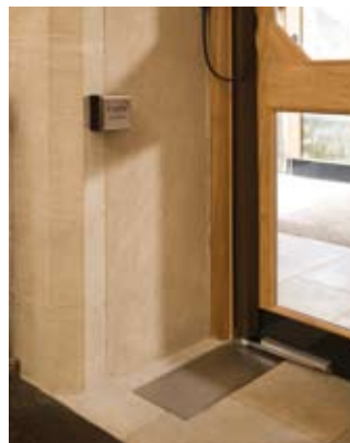
Top: Entrance barriers, The Angel Building