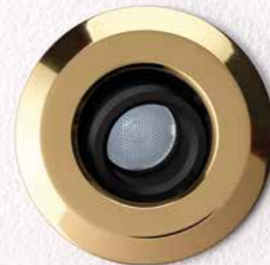
MINIMO TILT | Ø50MM POLISHED BRASS