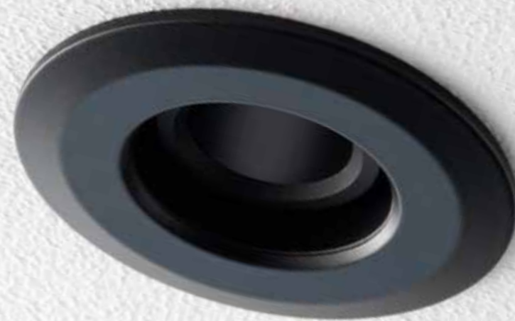
MINIMO TILT | Ø50MM

Whether the architectural concept emphasises functionality, aesthetics, or both, our aim is to find a solution that does justice to the project's architectural features. Our approach has given us an enviable reputation amongst leading UK and International lighting consultants and architects, often making us their first choice partner.