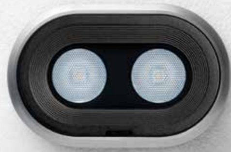
DOMINO 2 | SURFACE L:62MM, W:40MM, H:33MM BRUSHED ALUMINIUM