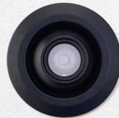
MINIMO EYE | Ø52MM BLACK