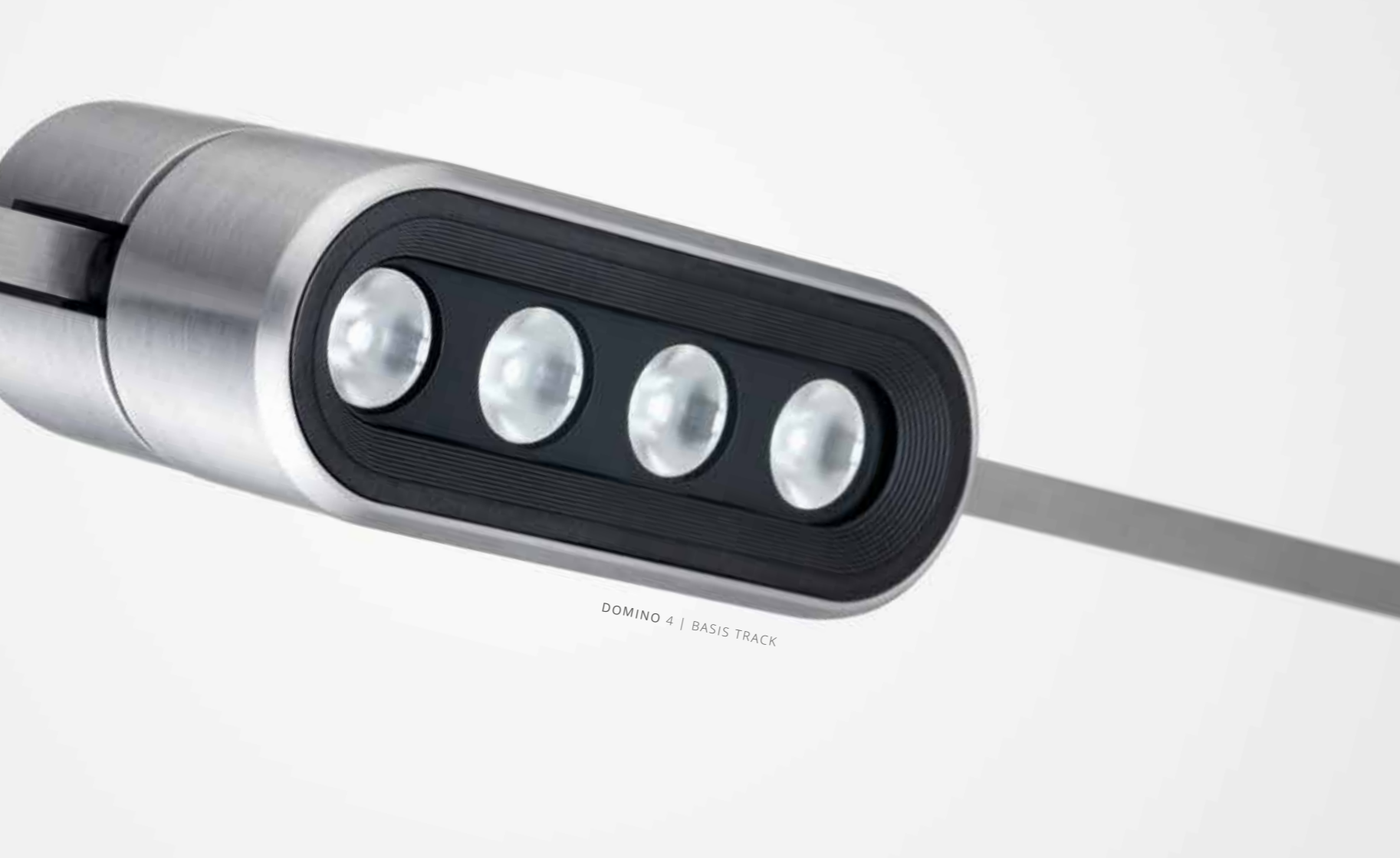
DOMINO 4 | BASIS TRACK