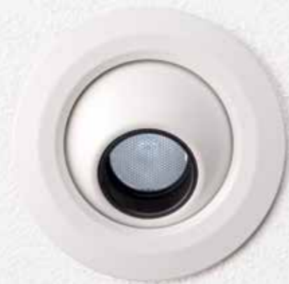
MINIMO EYE | Ø52MM WHITE

* Based on 12° optic. Choice of optic will affect lumen output.