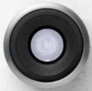
DOMINO 1 | SURFACE Ø40MM, H:33MM BRUSHED ALUMINIUM