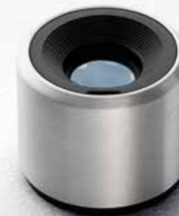
DOMINO 1 | SURFACE

Domino is perfect for casting pools of light for orientation through corridors and circulation areas. With flexible distributions, the family can also be used for additional ambience.