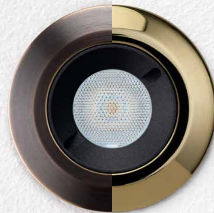
MINIMO FIXED | Ø40MM