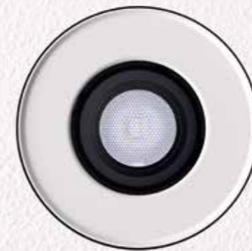
MINIMO TILT TRIMLESS | Ø46MM WHITE