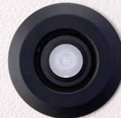
MINIMO TILT | Ø50MM BLACK