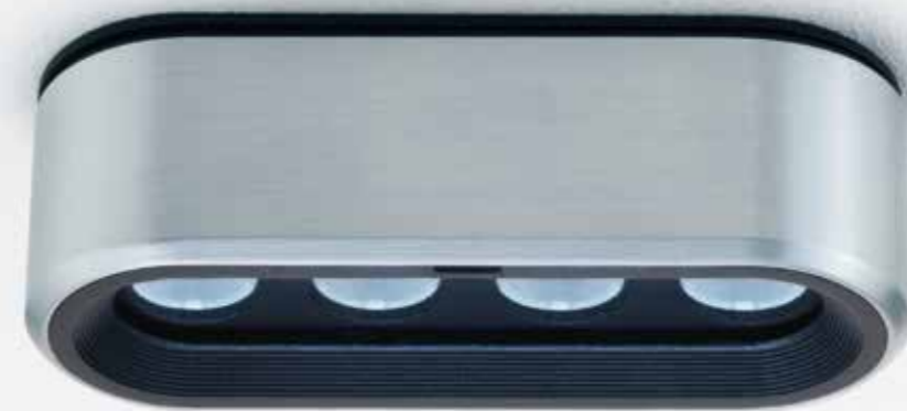
DOMINO 4 | SURFACE

Domino is a unique luminaire that offers multiple configurations of optics, delivering a comparable distribution to a downlight, yet crafted into a new aesthetic that evokes the pure lines and physical styling of the Precision LED spotlight collection. With surface, recessed and track options, Domino is a revolutionary approach to ambient lighting for corridors and other circulation areas, while offering the creative freedom that is ever-present throughout our portfolio.