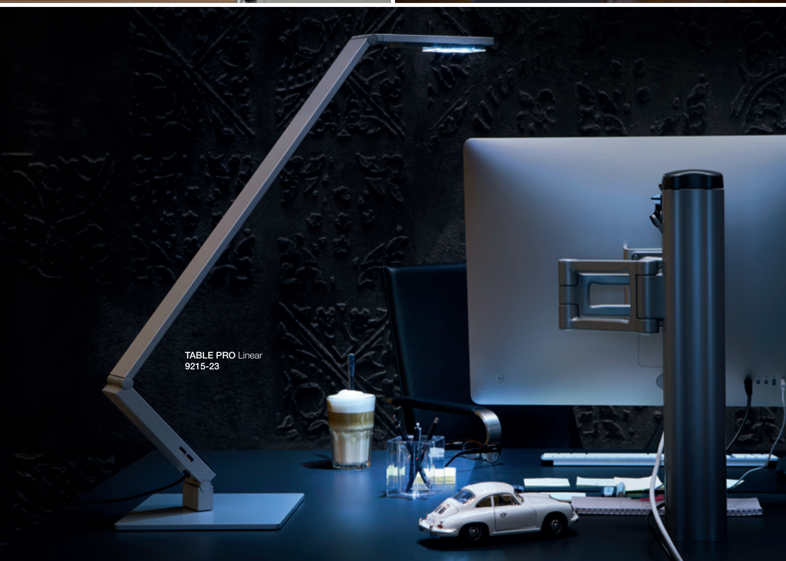
TABLE PRO Linear 9215-23