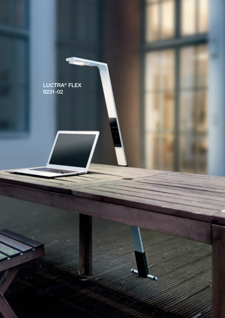
LUCTRA® FLEX 9231-02