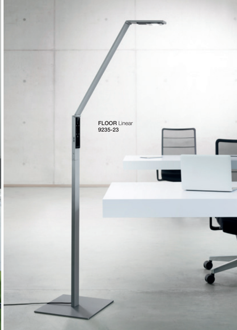
FLOOR Linear 9235-23