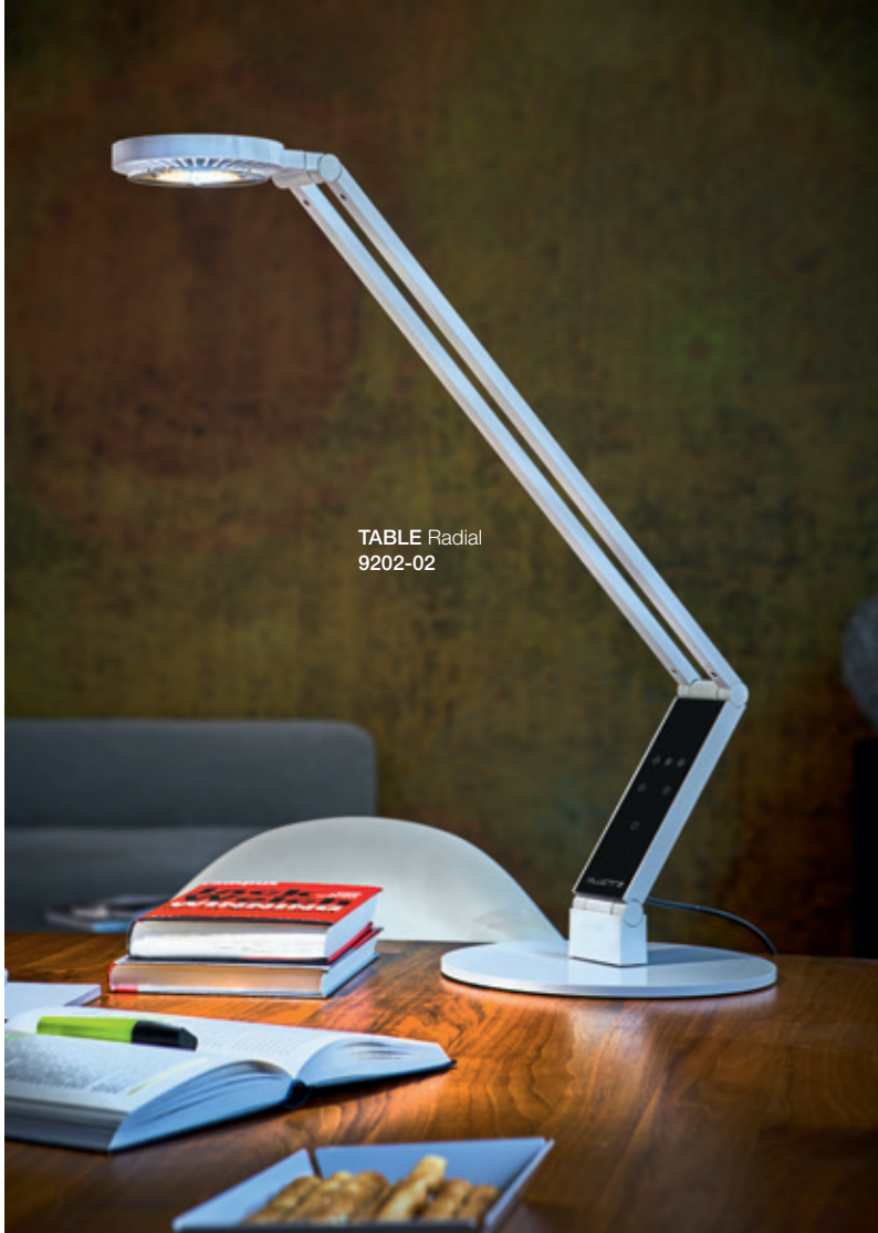
TABLE Radial 9202-02