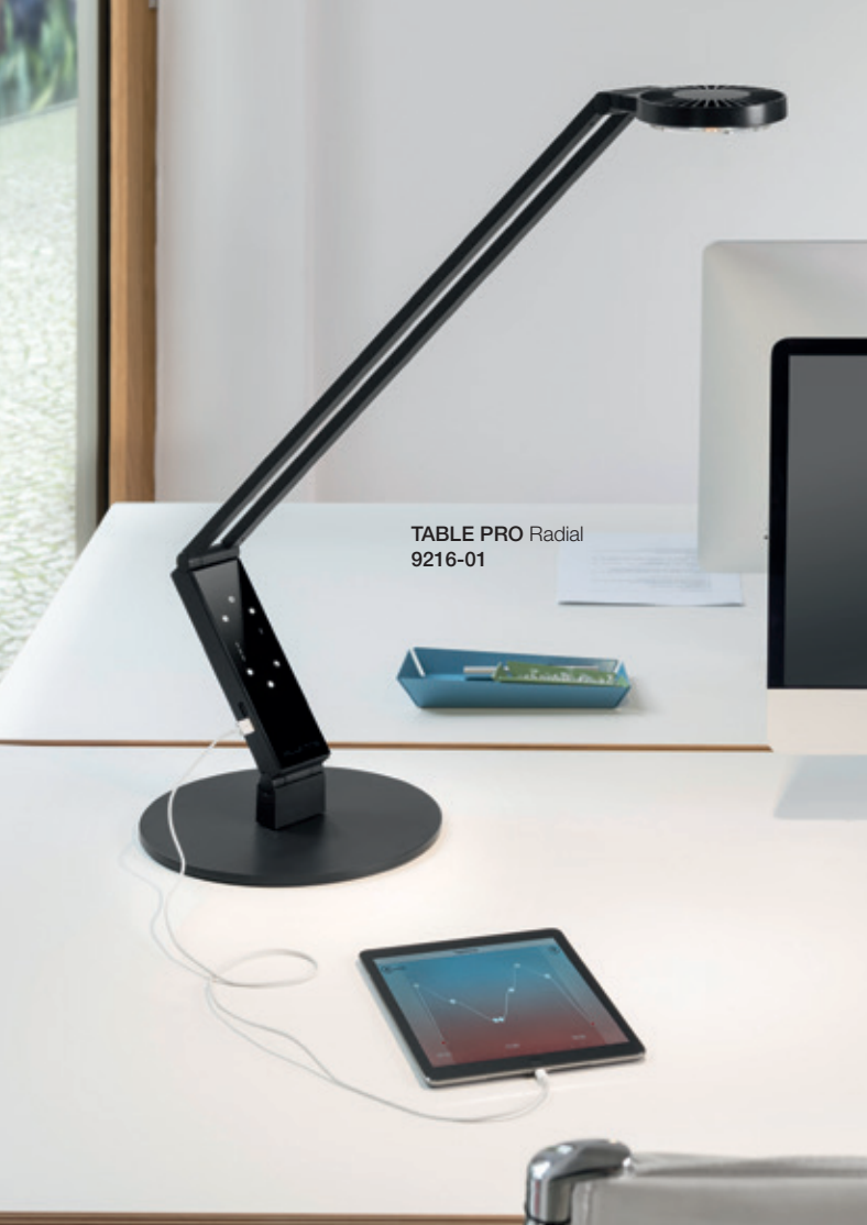
TABLE PRO Radial 9216-01