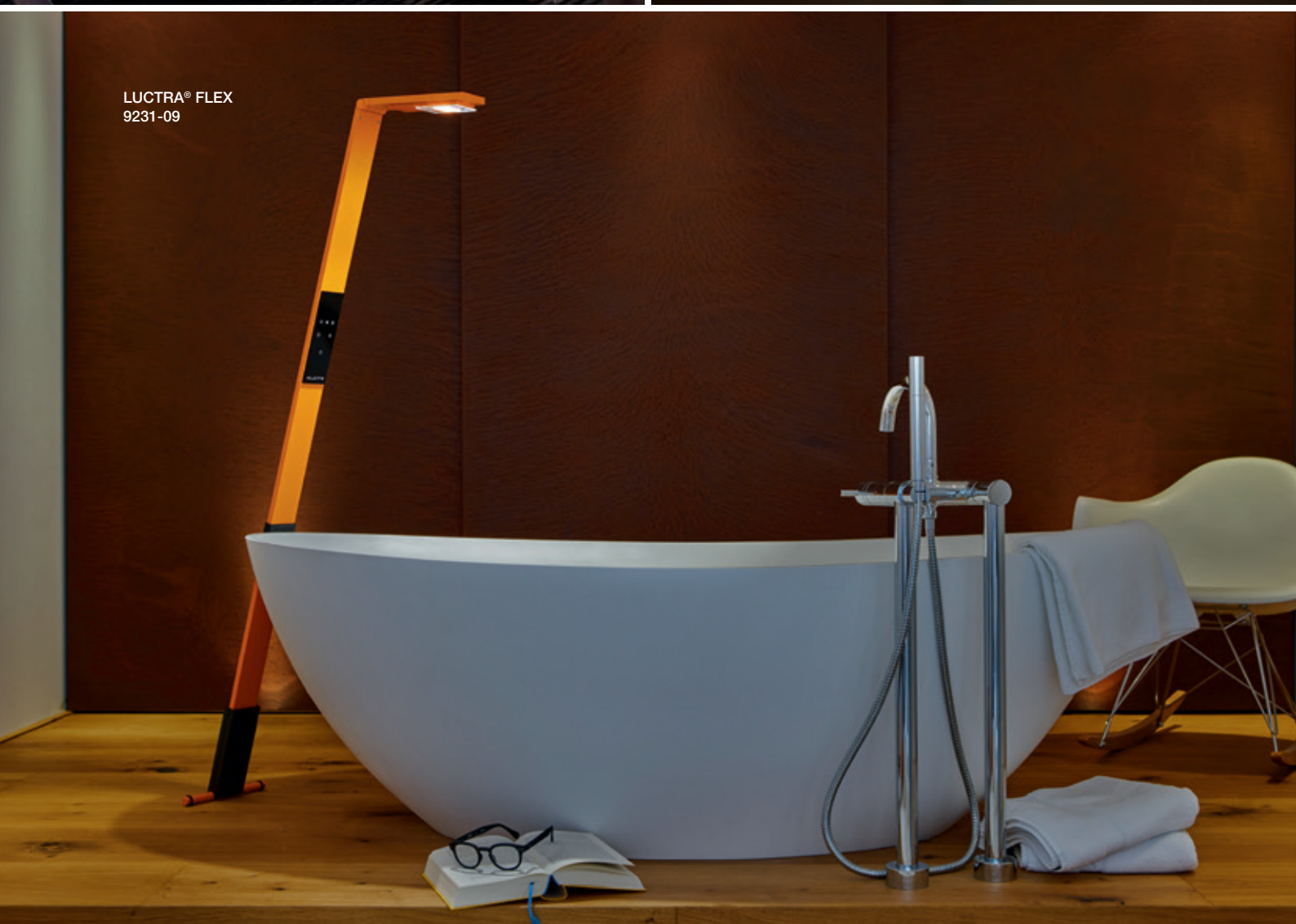
LUCTRA® FLEX 9231-09