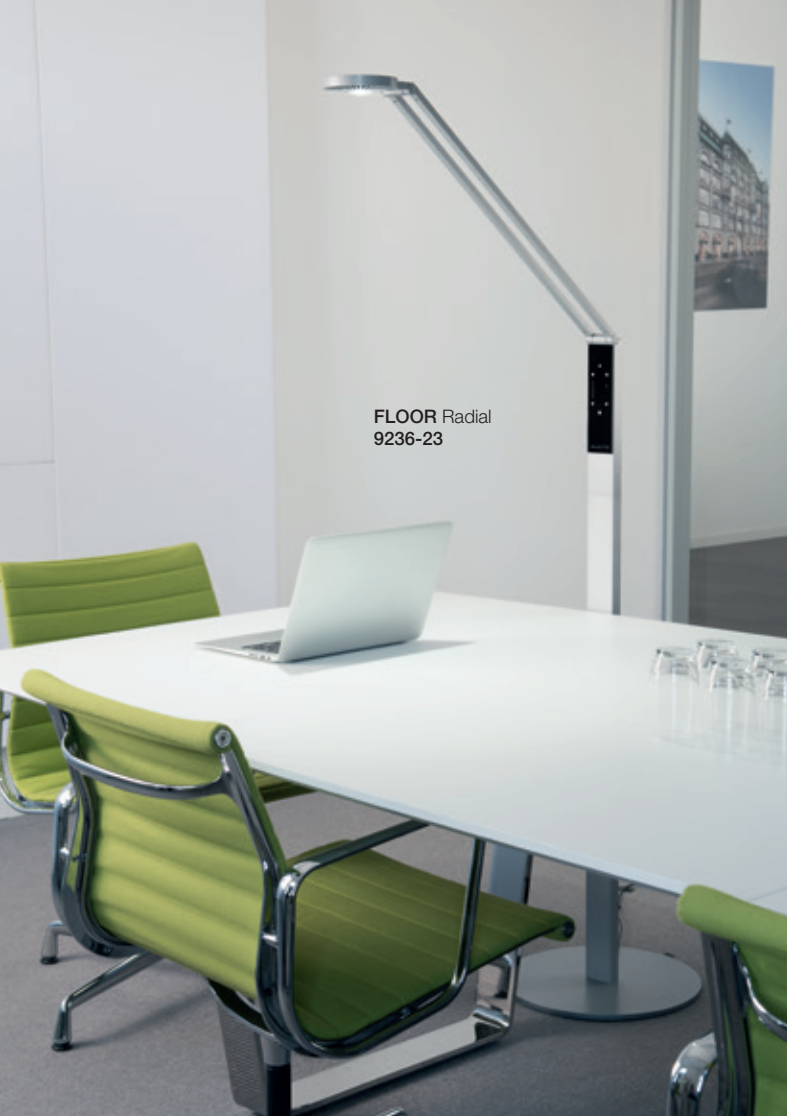
FLOOR Radial 9236-23